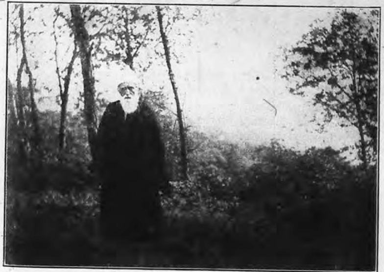
ABDUL BAHA AT GREENACRE