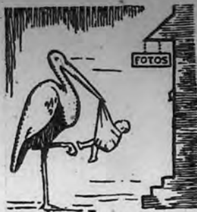
Born in the Business

"BORN in the business," easily one of the most attractive and original trademarks and the man who it describes is credited with being the most progressive and artistic photographer that New York has yet developed.