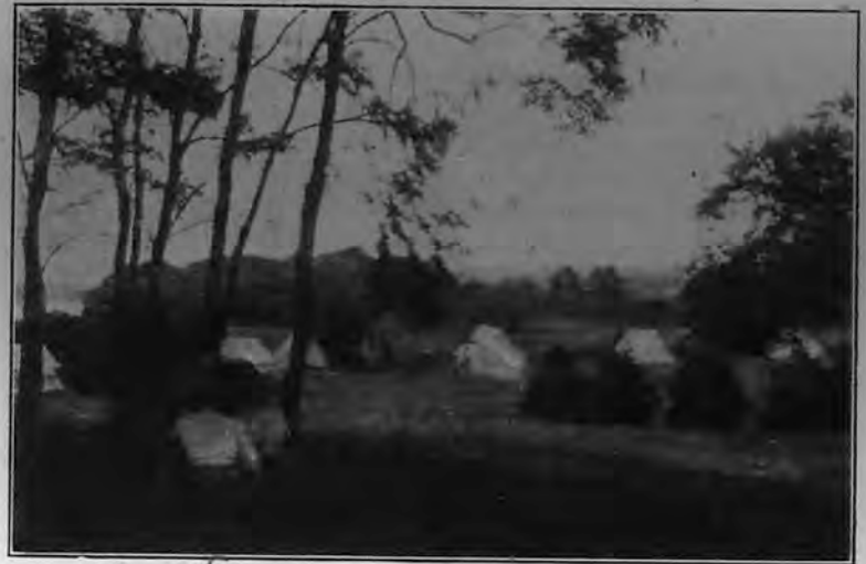
SUNRISE CAMP, GREENACRE, ELIOT, ME.